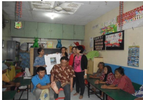
Figure 2. Elderly doing Quadriceps Setting

The results obtained after counseling using the demonstration method were as many as 71% of the elderly had a good level of knowledge of the Quadriceps Setting knee exercise. In this case, the knowledge of the elderly regarding the Quadriceps Setting knee exercise has increased significantly compared to before the counseling using the demonstration method was carried out. This is in accordance with research (Aeni et al, 2018) that in the demonstration method educators can guide participants towards the same thinking in the same line of thought so as to reduce errors when compared to just reading or listening because participants get a clearer picture. from what has been observed. If the elderly get a clearer picture and understanding, the complaints of knee pain felt by the elderly in the Tambakmayor Elderly Community assisted by the Putri Kasih Foundation, Surabaya can decrease. The elderly in the elderly community assisted by the Putri Kasih Foundation can apply the correct Quadriceps Setting exercise every day to reduce complaints and reduce the risk of knee pain.